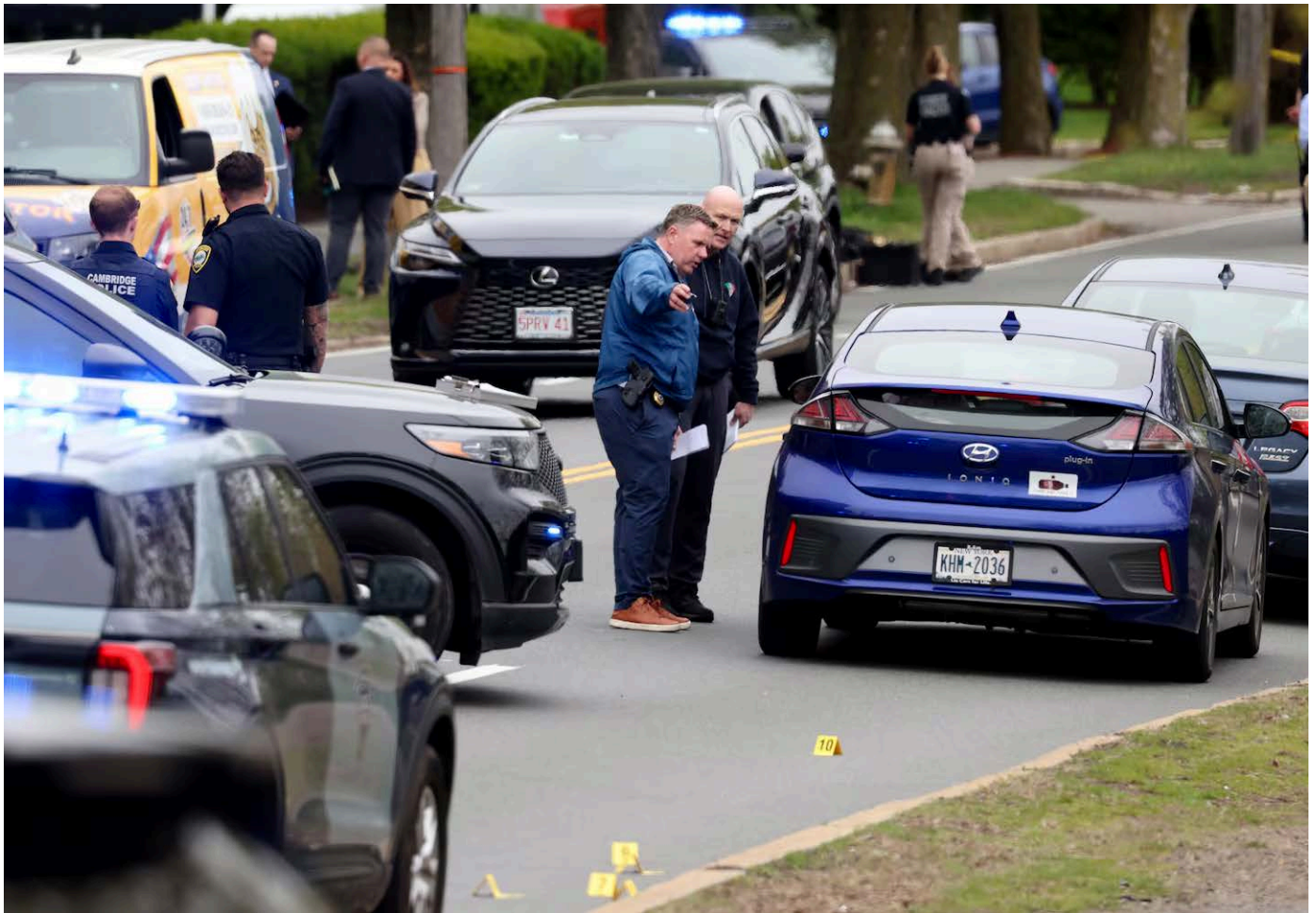
Officers interviewed people sitting in a car on Memorial Drive.