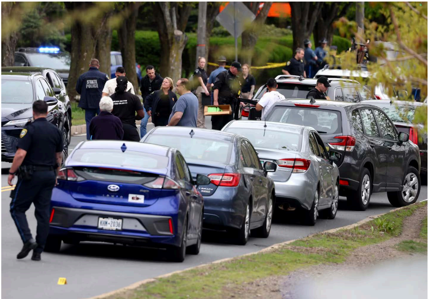
Motorists and a heavy police presence filled the scene on Memorial Drive in Cambridge on Monday.