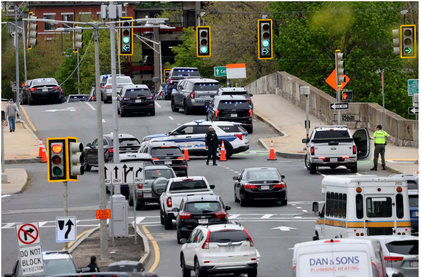
Cars were detoured trying to cross the River Street Bridge amid a heavy police presence on Memorial Drive in Cambridge on Monday.