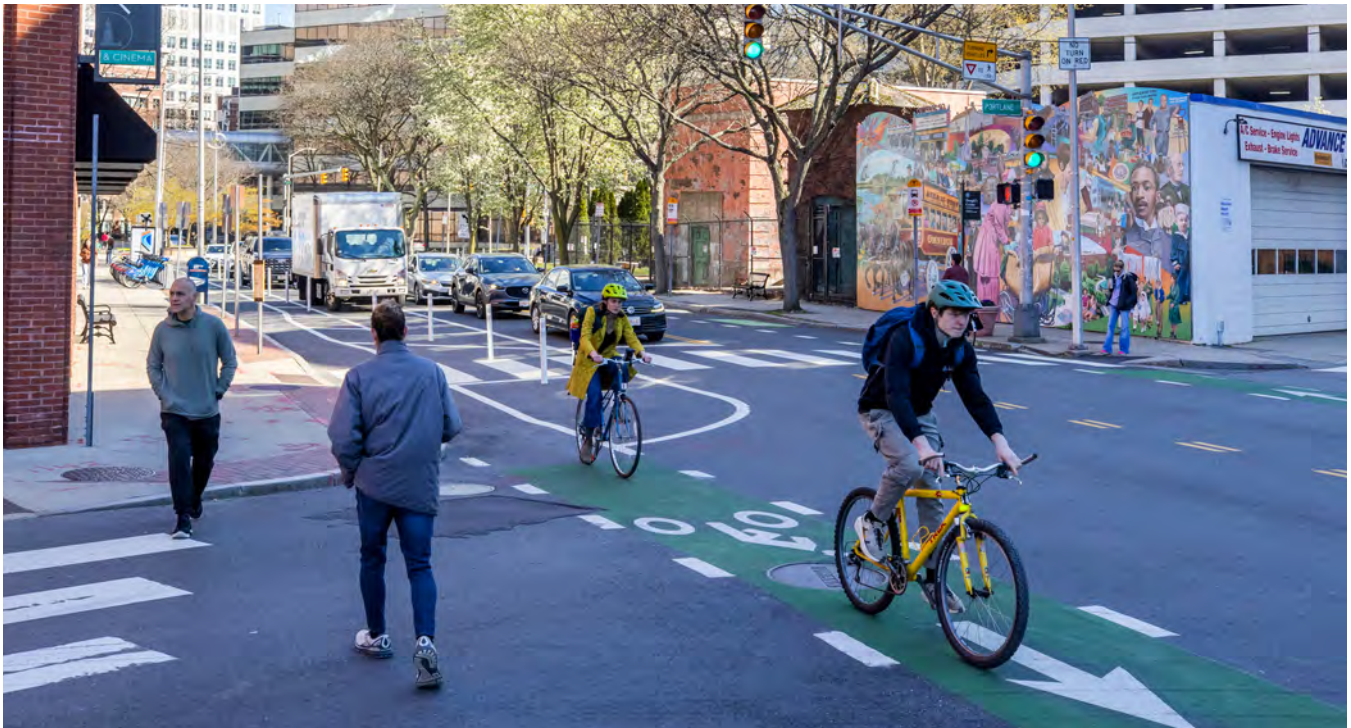
Hampshire Street Safety Improvement Project, April 2024 by Kyle Klein.