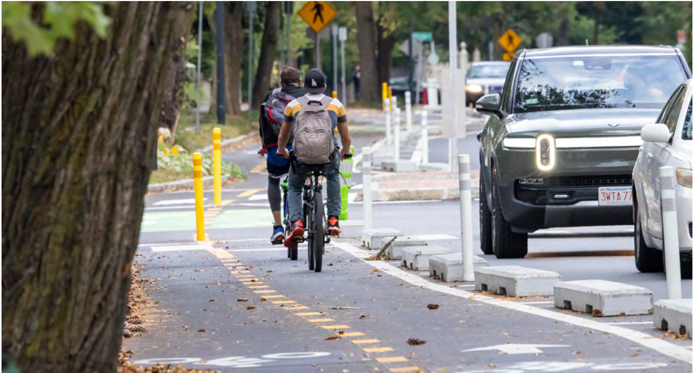
Brattle Street Safety Improvement Project, October 2023 by Kyle Klein.