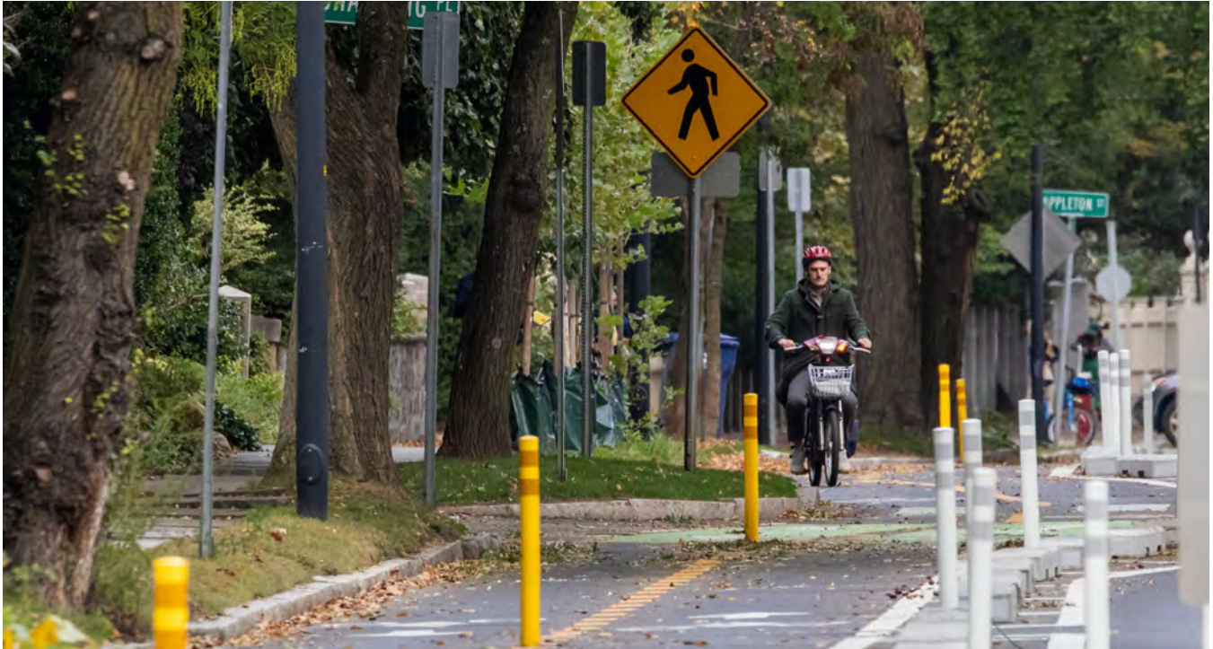
Brattle Street Safety Improvement Project, October 2023 by Kyle Klein.