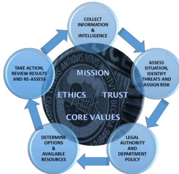
Figure 5: This CDM depiction hangs in CPD's small training room

While CPD makes use of the CDM for the department's operations, the CDM is not integrated into its UOF policy. CPD would benefit by expressly incorporating the CDM into its UOF policy, which would reinforce the expectation that officers should apply it to all aspects of policework, including decisions about the use of force. Baltimore (MD) Police Department devotes a portion of its Use of Force Policy to "Critical Thinking" in which it recites the CDM principles; CPD can use Baltimore's policy as a model. 13