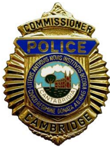
Christine Elow Police Commissioner